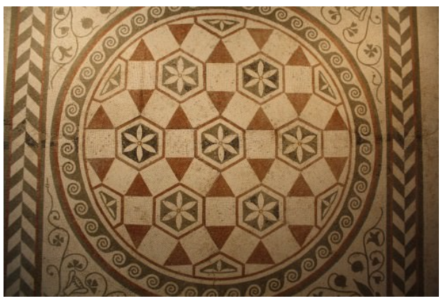
Example of Roman Geometric Mosaic (http://www.ancient.eu/article/498/)