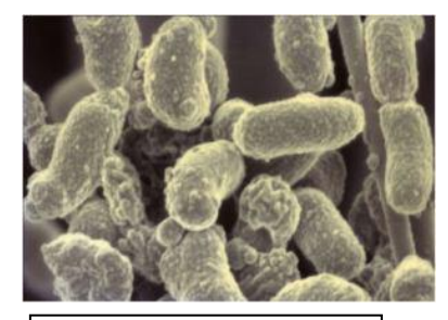
Gingivitis – bad breath (Rod)