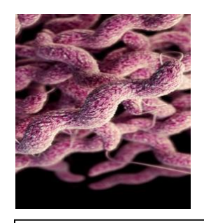
C. Coli/ Diarrhea(spiral)