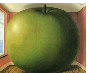
The Listening Room 1952 Menil Collection, TX

The Son of Man 1964 Private collection Advanced Preparation