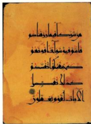
Koran from Persia 11th C. Where images are not allowed, writing (line) can sometimes become the artform.