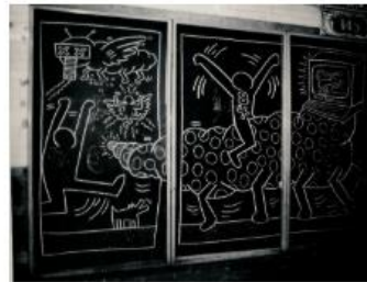
Subway Drawing, Keith Haring (American), 1983. Line showing action, just for fun.