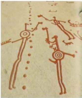
Swedish Hieroglyphics. Line telling story and creating design.