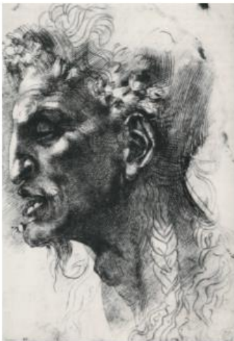
Head of Satyr, Michelangelo, 1600. Line shows shape and form and texture.