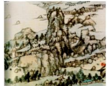
Waterfall on Mount Lu, Shih T'ao (1631-1707). Line as Texture.